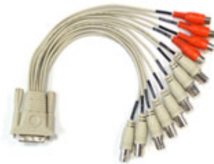
8 cam video cable