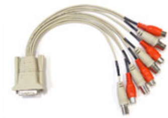
4 cam video cable